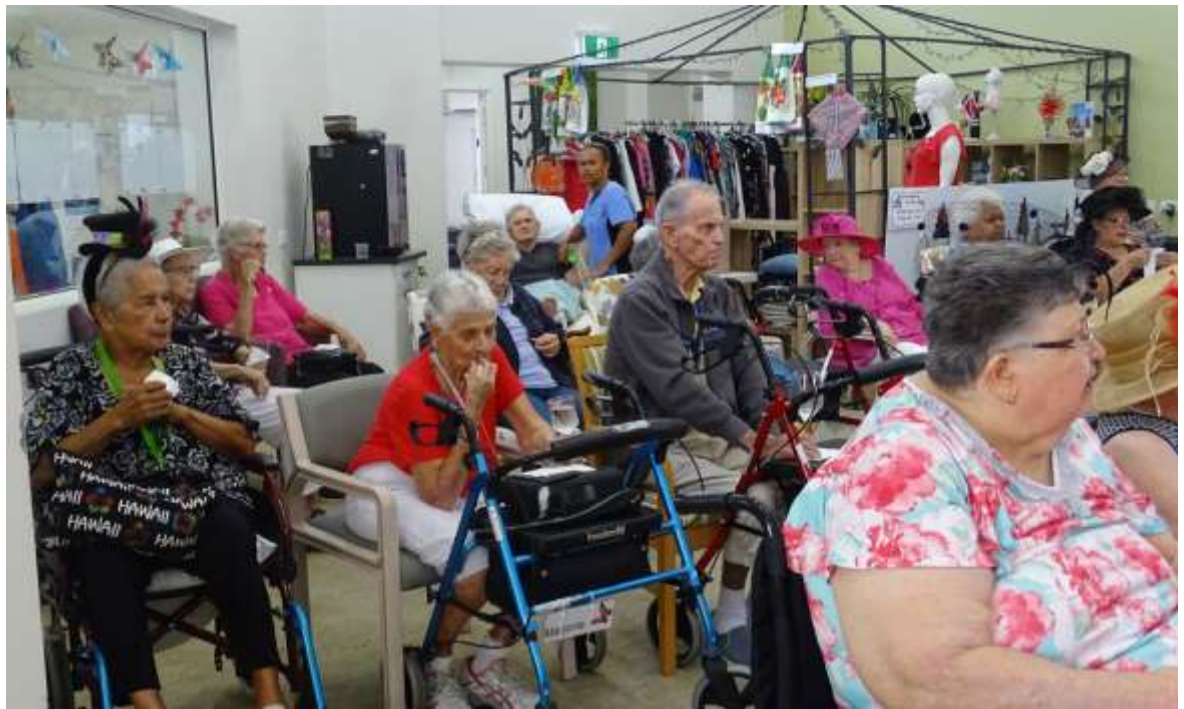
Waiting for the race to start !