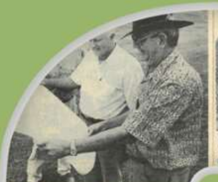
Shire residents work together for centre funds