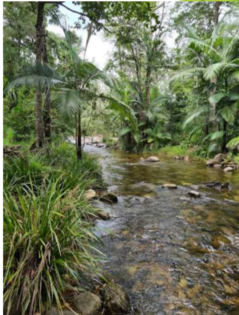
Boulder Creek - Mt Charlton

Nanyima Residential Aged Care Monthly Newsletter