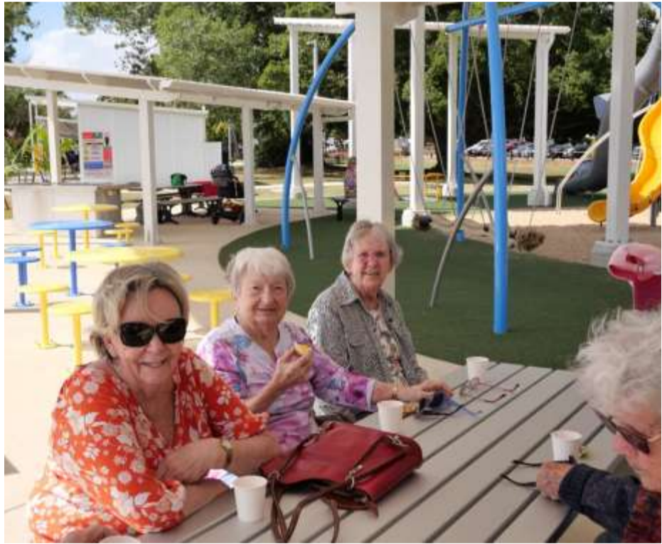
Everyone enjoyed having lunch at the new Water Park on the foreshore.