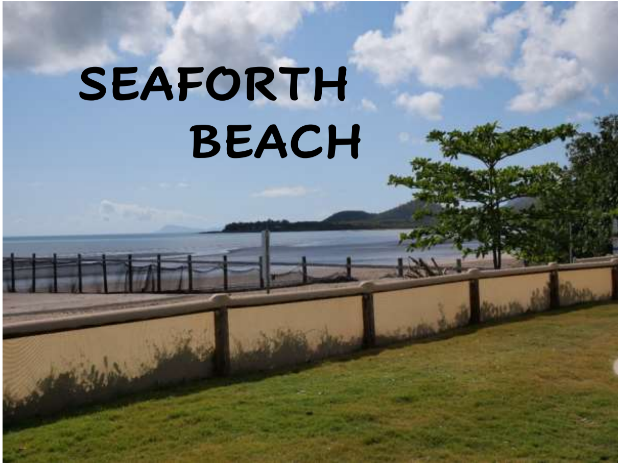
The destination of our Mystery Bus Tour